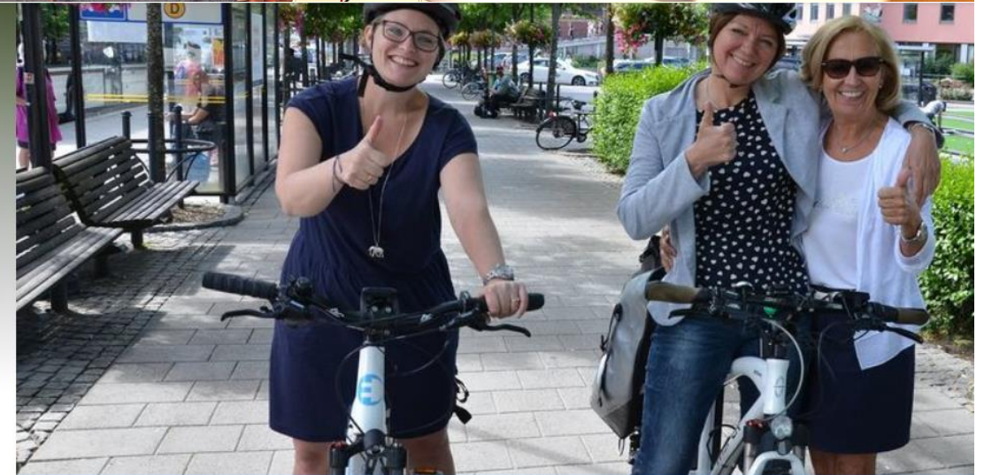
Gruppe fra Miljødirektoratet